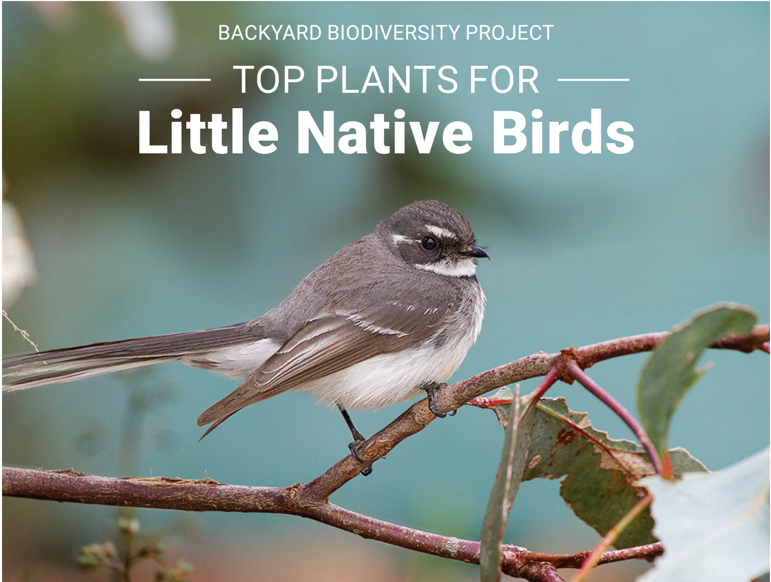
Grey Fantail image

Did you know that you can make your garden more attractive to our beautiful tiny native birds by including suitable indigenous (locally-native) plants in your garden?